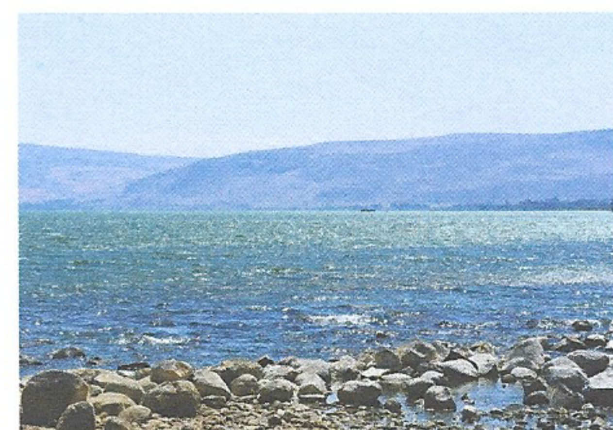
View of the Sea of Galilee from the shore

Disciples normally chose to follow the rabbi whose teachings and way of life impressed them: Jesus is unusual in selecting his disciples.