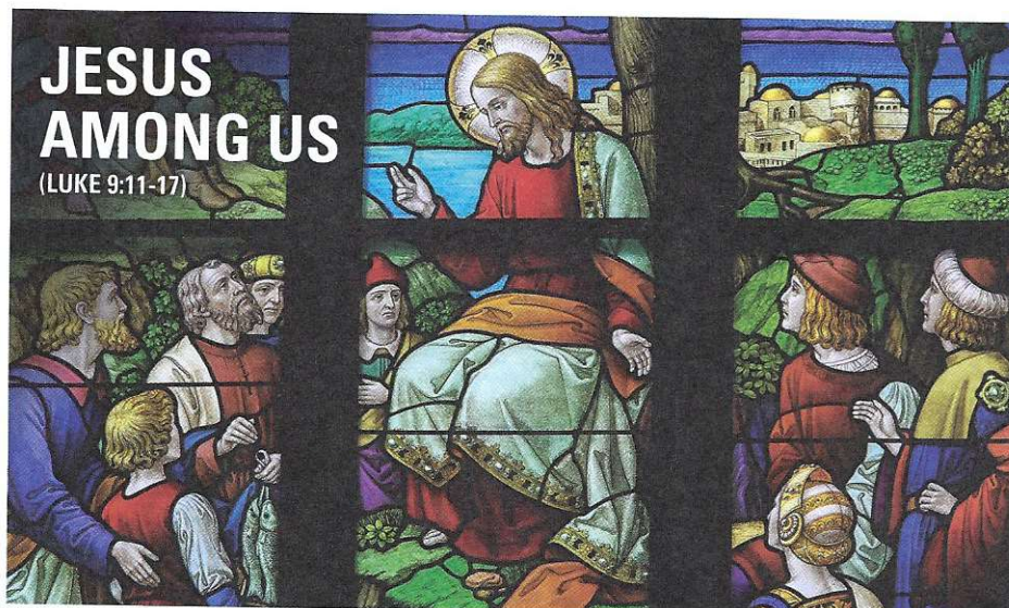
The miracle of Jesus feeding the multitude with loaves of bread and fish: scene from the Cathedral of St Rumbold in Mechelen, Belgium

Jesus' initial reaction to the arrival of the crowds is to welcome them, teach them and cure those in need of healing.