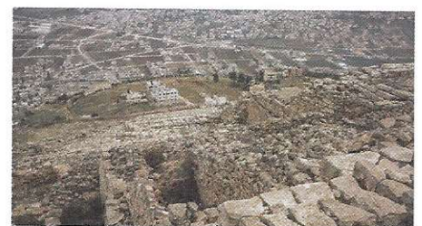
The ruin of Mount Gerizim

They built a rival temple to that of Jerusalem on Mount Gerizim: this underlies Jesus' conversation with the woman at the well in the Gospel of John.